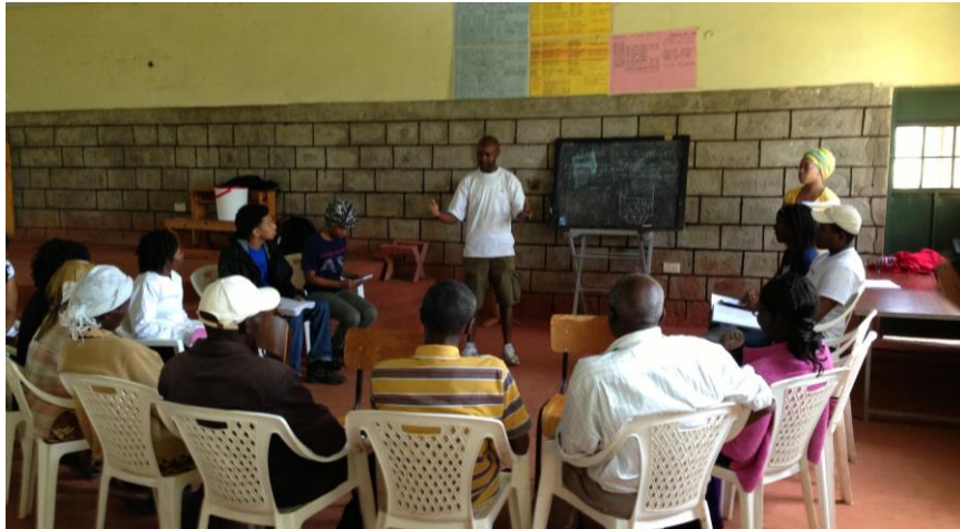
Figure 1: EWB-HU Student Chapter conducting an education, knowledge and technology transfer session with selected community members who would be designated as community engineers.

different methods of water purification, including boiling, treatment with chlorination tablets and then the BSF process. Water collection training included training on wells, water pumps and rainwater harvesting.